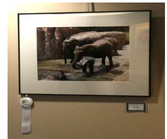
Honorable Mention-Eleanor Richter “At the Watering Hole”