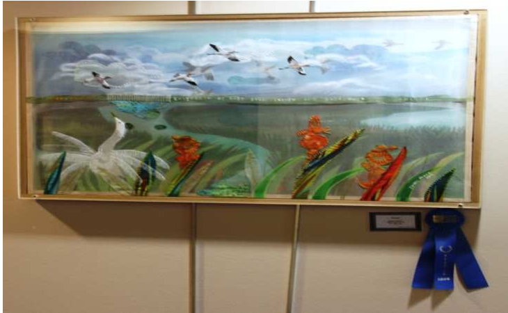
Best in Show—Isabel Perez “Wind”