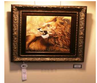
Honorable Mention-Valery Kocab “Fury”