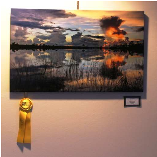
3rd Place—Robert Grauer “Sunset Pine Glades Lake”