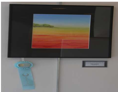
Merit Award—Gisela Bender “Landscape Series #3”